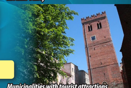
Municipalities with tourist attractions