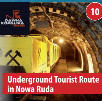
Underground Tourist Route in Nowa Ruda

Fantastic views of the adventure ... Adventure in a beautiful natural landscape! Take a rest while rafting! Relax at our marina! Pontoon rafting on Bardo Gorge is an expedition through five meanders of Nysa Kłodzka river. And when you get hungry, we'll serve you a fresh trout.