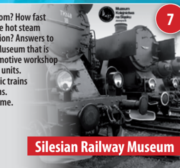
Silesian Railway Museum

One of the greatest attractions of the Śnieżnik Massif is the Bear Cave, located on the right slope of the Kleśnica Valley, in the marble block within the Stroma Mountain (1116.8 m a. s. l.). It is the longest cave in Sudeten Mountains and one of the biggest in Poland. The tourist route that is accessible for tourists is about 360 m long, on which you can see about 500 m of cave.