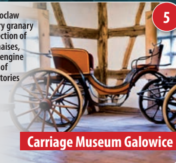
Carriage Museum Galowice

Yearning for thrills? Try the Laser Tag arena! It is a martial, post-apocalyptic action area. A maze with observation points for a sniper and potential ambushes on each corner. Chaotic, remarkable scenery, where everything can happen - even one false move can mean loss.