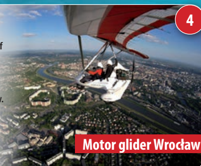
Motor glider Wrocław

Get ready for a unique journey to the times when the automotive industry had an individual and unique character. We will try to move you to the distant time of the beginning of Polish automotive industry, such as the legendary Sokół 1000 motorcycle, Fiat 508 from Polish assembly. You will also find here the Poland's largest collection of Rolls-Royce and Bentley cars.