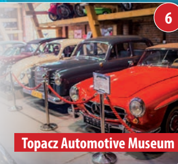
Topacz Automotive Museum

Where did the railway man's red cap come from? How fast was the fastest steam locomotive? How is the hot steam generated, what puts the locomotive in motion? Answers to these questions you can get by visiting our Museum that is situated on the premises of the historic locomotive workshop and includes nearly 150 railway rolling stock units. The museum also organizes rides with historic trains and is a meeting place for old technology fans. The museum is open every day. You're welcome.