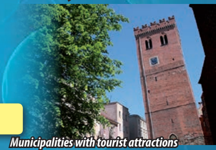
Municipalities with tourist attractions