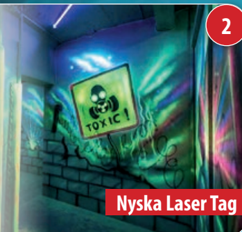
Nyska Laser Tag

Welcome to the largest bowling alley in Wrocław!