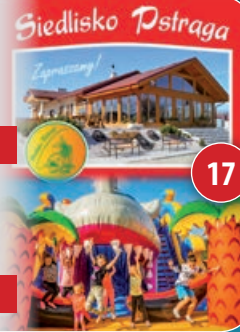
Mega Fish Park