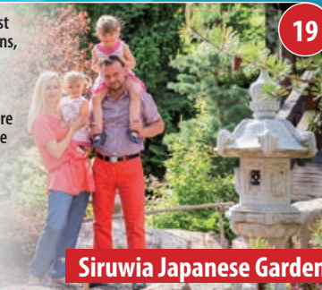
Siruwia Japanese Garden