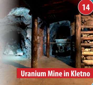
Uranium Mine in Kletno