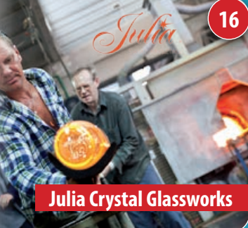
Julia Crystal Glassworks